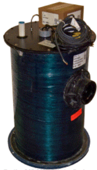
Zoeller 915-0007 Grinder Package

The Zoeller 915 Series SHARK Grinder Pump Package System comes complete with the Zoeller 915 series 1/2 hp 115 volt sewage grinder pump, pre plumbed from the factory in a 18" x 30" Fiberglass Sewage Basin. The model 915-0007 sewage grinder pump comes suspended from the 18" lid, making it easy to install into the basin, or to retrofit a 18" x 30" basin already installed in the basement floor. Now moving to a sewage grinder pump system from a regular 2" discharge sewage pump is easier than ever before.